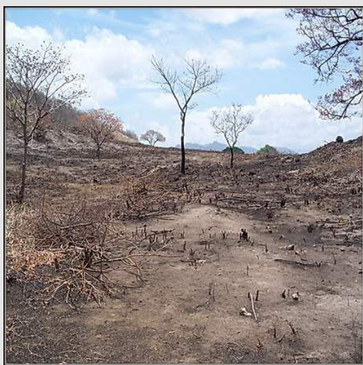
These photos won a prize in an environmental forum in the category: Reflection to Protect Natural Resources